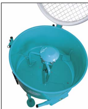
Forced-duty planetary system for a remarkable batch time reduction

Powerful and versatile, Mix 120 plus batches the most difficult products, both traditional and pre-mixed materials